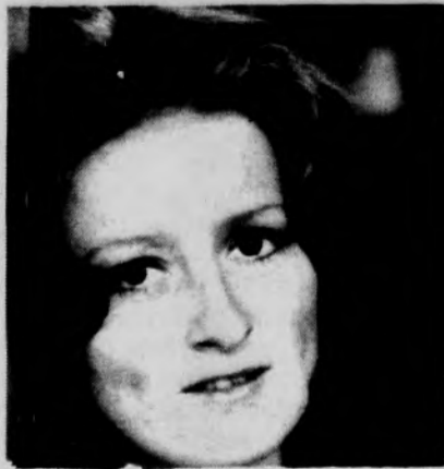
Bonnie Raitt at Valley Forge Music Fair, Sun. Aug. 24.

Bonnie Raitt. Sun. Aug 24th at 7:30 pm. Tickets are $9.75 & $10.75.